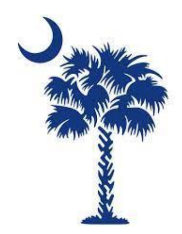
"Serving those who served and sacrificed for America"