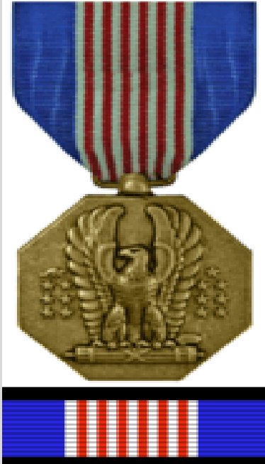
Picture of the Soldier's Medal and Ribbon

The Soldier's Medal is considered to be equivalent to the Navy and Marine Corps Medal, the Airman's Medal, and the Coast Guard Medal.