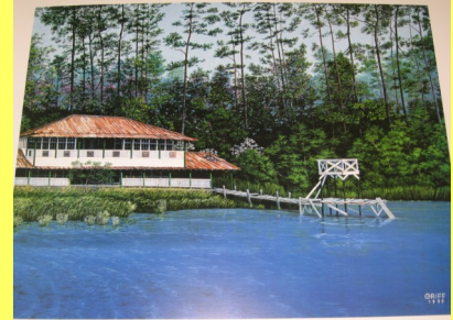
Gibson's Pond in Lexington

We have several copies of both of these prints for sale in our office. The cost is $10.00 each. The proceeds will be placed in our Veteran's Fund and/or Van Fund. Your donation is tax-deductible and a receipt can be provided if you wish. To have a closer look at the prints, we have framed copies in our lobby. Please stop by our office M-F from 8 to 5 to purchase one or more of these beautiful prints!