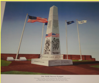
Veteran's Monument across from the Administration Building