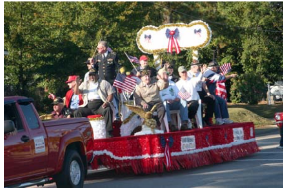
Scenes From 2008 Parade

This is an excellent activity for local church or civic organizations! Let's all make this year's event better than ever! The Grand Marshalls of the 2009 Parade will be former POW'S.