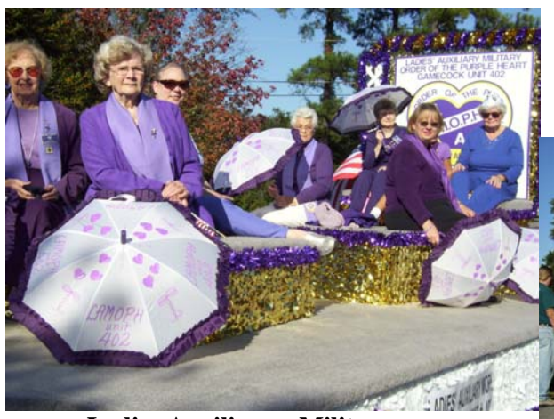
Ladies Auxiliary—Military Order of the Purple Heart