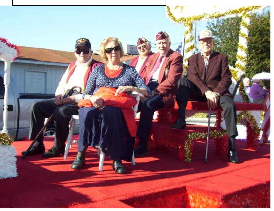
Grand Marshalls - Former Prisoners of War