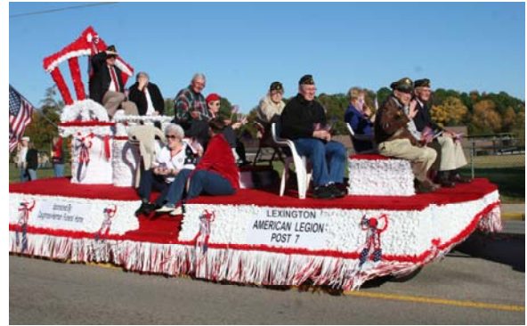
Ladies Auxiliary, Military Order of the Purple Heart