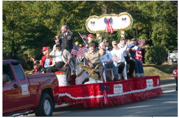
Grand Marshalls — Vietnam Veterans

For reprints, go to their website www.lexingtonchronicle.com.