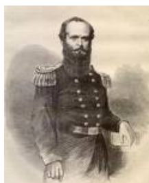
GENERAL ULYSSES S. GRANT

It is staffed with mental health professionals, as provided by the U.S. Department of Veterans Affairs.