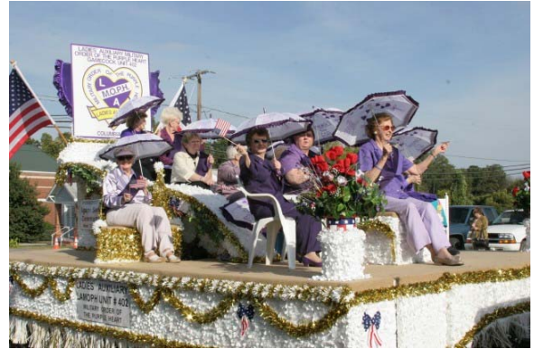
LAMOPH Gamecock Unit 402 Lexington County Veterans Day Parade

Close relatives of Purple Heart recipients are eligible to belong to the Ladies Auxiliary of the Military Order of the Purple Heart, which does important work nationally and locally in Veterans' Hospitals. Further information about the Order and its auxiliary may be obtained from National Headquarters at: The Military Order of the Purple Heart, 5413-B Backlick Road, Springfield, VA 22151 (703-642-5360) FAX (703) 642-2054.