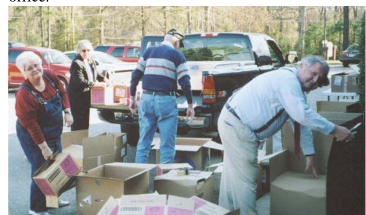
Volunteers packing and wrapping over 1,000 pounds of Girl Scout cookies for shipment to our troops overseas.

If you are able to provide assistance through donation of time or resources, please contact the VA office.