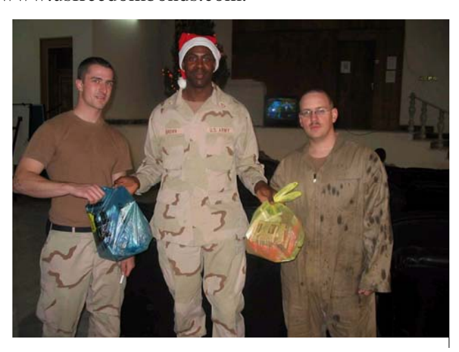
Santa Claus delivering Blue Star Mother packages to more of our troops.

The Patriot Girls are promoting US Savings Bonds to support our troops fighting the war on terrorism. For more information, visit their website at www.usfreedombonds.com.