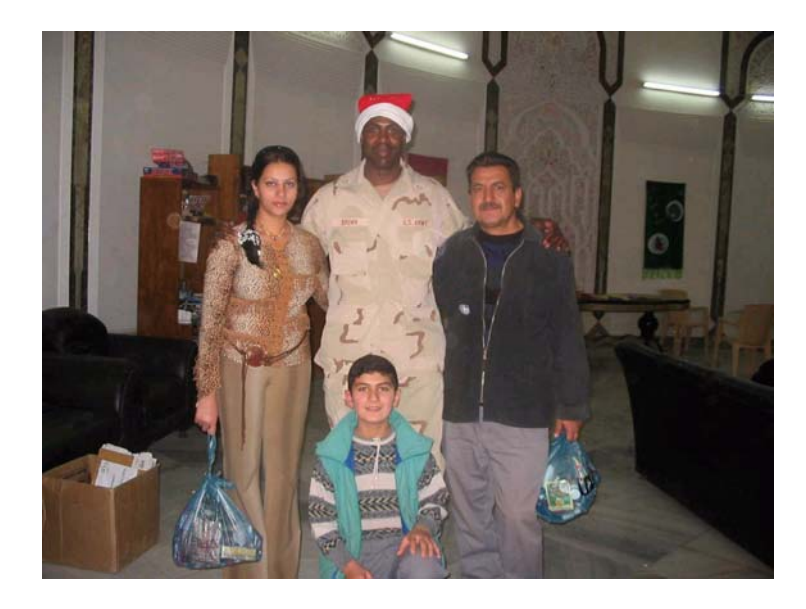
A family of Iraqis receiving Christmas gifts provided by the Blue Star Mothers.

Below- Some of America's finest as they receive Christmas gifts provided by the Blue Star Mothers of SC.