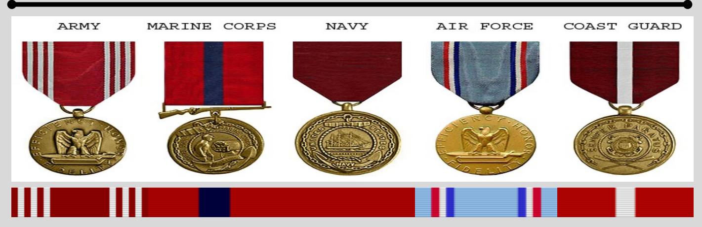
Picture of medals and ribbons—Army, Marine Corps, Navy, Air Force and Coast Guard

The Good Conduct Medal is one of the oldest military awards of the United States military. The Good Conduct Medal is awarded to any active-duty enlisted member of the United States military who completes three consecutive years of "honorable and faithful service". Such service implies that a standard enlistment was completed without any non-judicial punishments, disciplinary infractions, or court martial offenses. If a service member commits an offense, the three-year mark "resets" and a service member must perform an additional three years of service without having to be disciplined, before the Good Conduct may be authorized.