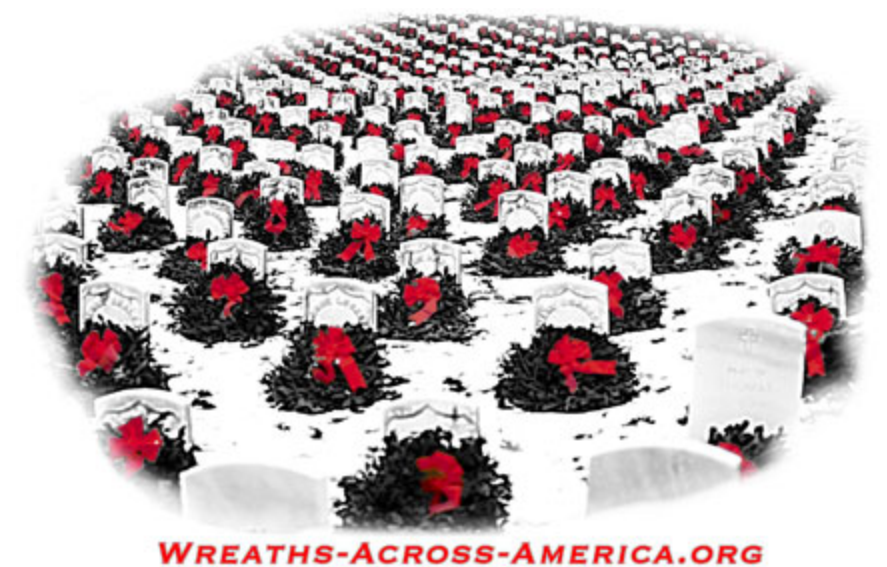
REMEMBER - HONOR - TEACH

2010 will mark the 19th anniversary of Worcester Wreath Company donating Maine wreaths to adorn the headstones of our Nation's veterans at Arlington National Cemetery. In addition to 15,000 wreaths destined for Virginia, Worcester Wreath will again donate 7 ceremonial wreaths to over 410 State, National and local cemeteries across the Country. In 2009 wreath-laying ceremonies were coordinated in 24 foreign cemeteries and aboard Naval ships in all Seven Seas, this tradition continues into 2010.